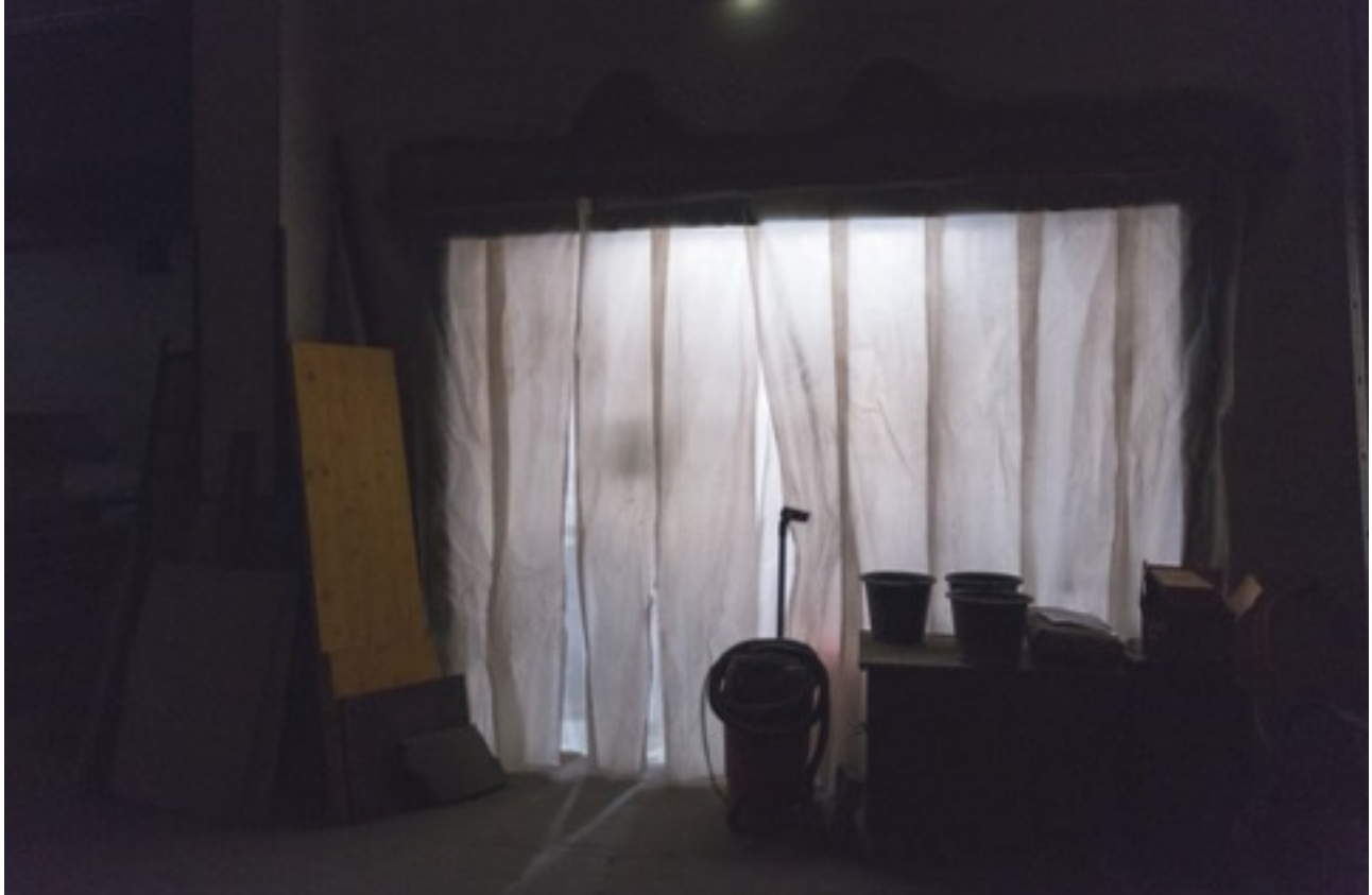
Tell me more about the area your studio is in? And the building? The building is fantastic! The material it was built for is the opposite of concrete. It used to be a factory, where they cut foam, for mattresses and stuff. I think it was the only place in Vienna where you could buy this. It was built in the 60s.